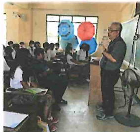
At a public high school explaining to the students how to be saved.

Thank you for your continued support and your love and prayers for us. May God richly bless you for all your sacrifices for the sake of the Gospel.