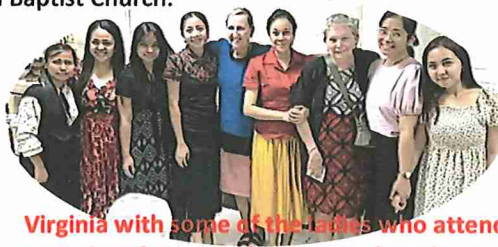
Virginia with some of the ladies who attended a seminar for pastor's wives and workers.