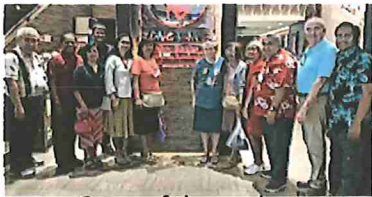
Some of the graduates of the Bible Institute.