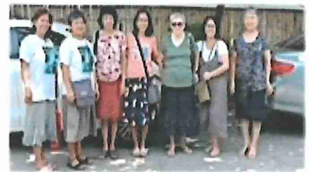
Prayer Warriors group of Bethel Baptist Church