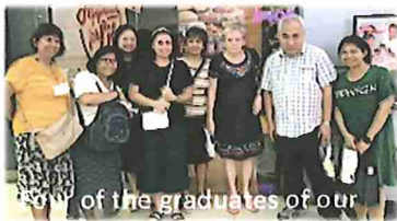
Some of the graduates of our school took us out to supper. They all now have fantastic jobs.