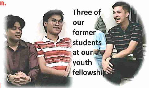
Three of our former students at our youth fellowship