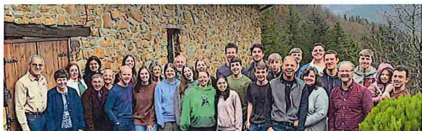
Missionary Teen Retreat in Europe